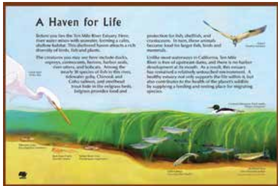
Ten Mile Bridge and Estuary, Mendocino Coast, CA, California Department of Transportation.

Thank you for using this checklist. If you have any questions, or you'd like to suggest additions to the checklist, please don't hesitate to email us at efielder@mcn.org . May all your interpretive projects meet your budgets!